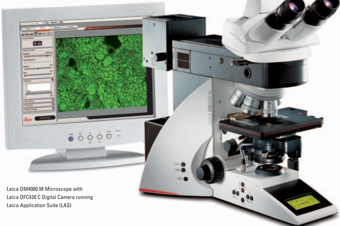
Leica DM4000 M Microscope with Leica DFC420 C Digital Camera running Leica Application Suite (LAS)